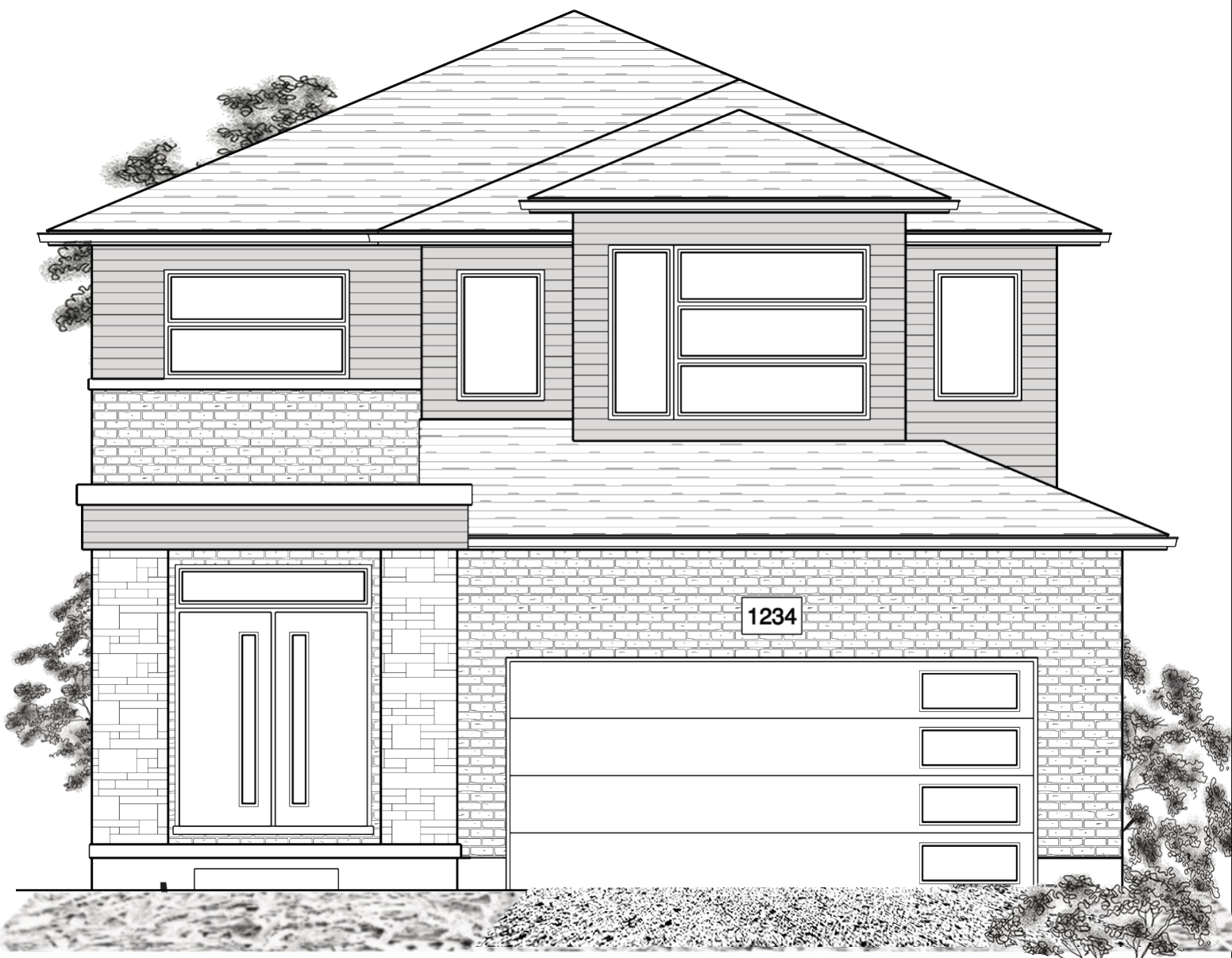
Standard Brick and Stone Elevation